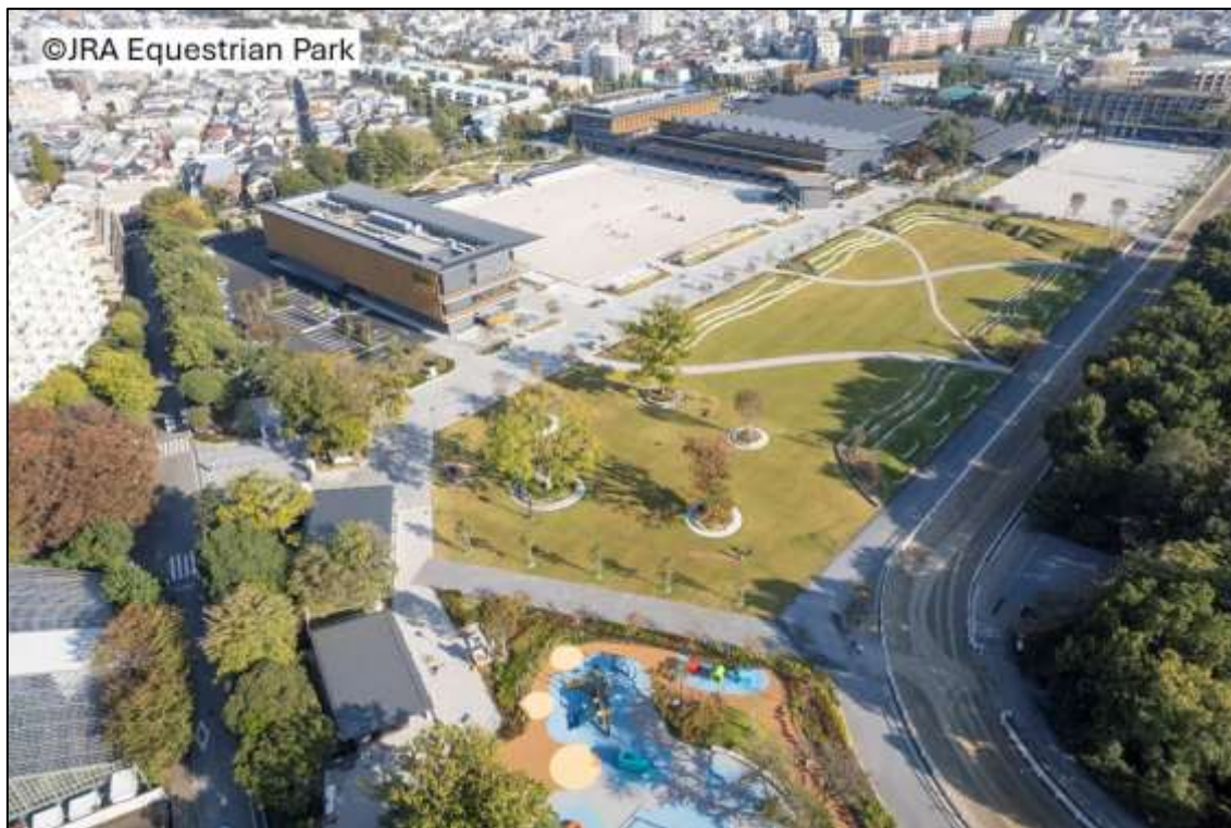
Image of the competition venue in its legacy layout.